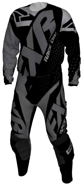
BLACK OPS JERSEY 193301-1010- | PANT 193328-1010-

New lightweight polyester birdseye knit fabric Moisture-wicking yarns dry quickly Shaped front collar and tapered cuff New slim fit Drop-tail hem and long length protect midriff exposure Fade-free sublimation prints