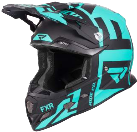
BLACK/MINT | 190606-1052- [MATTE FINISH]