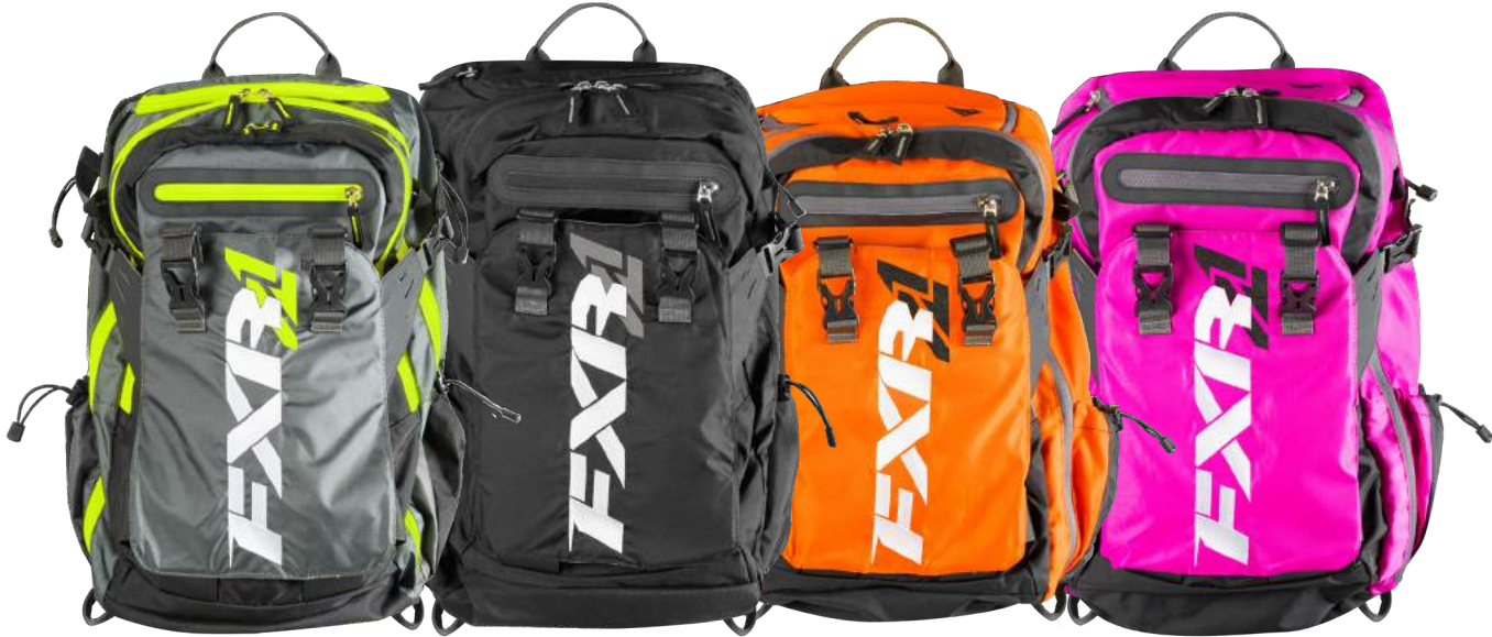
BLACK/CHAR/HI-VIS | 183202-1065- BLACK OPS | 183202-1010- ORANGE/BLACK | 183202-3010- FUCHSIA/BLACK | 183202-9010-