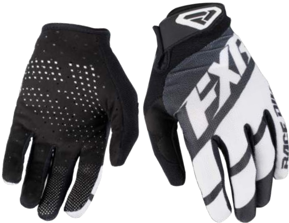
BLACK/WHITE | 193352-1001-