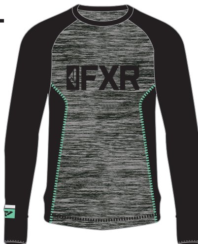
GREY HEATHER/MINT 191430-0752-

140gsm 100% polyester interlock knit Moisture-wicking and anti-microbial finish Flat-lock seaming for superior comfort Full sublimation print Jacquard elastic waist Tapered ankles reduces bulk under pant and inside boot