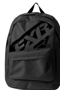
BLACK OPS 183201-1010-