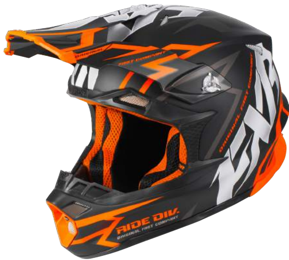
BLACK/ORANGE | 190602-1030- [MATTE FINISH]