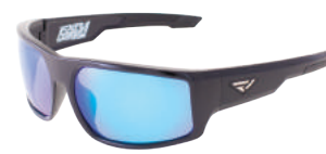
BLACK/BLUE | 16714.400