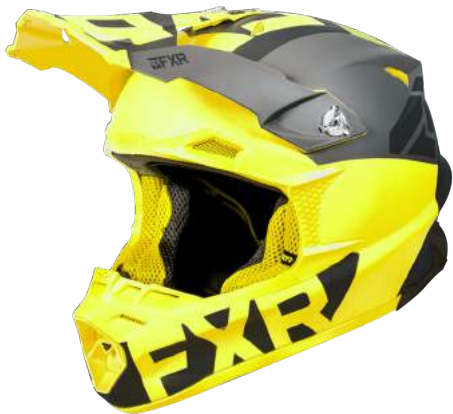
BLACK/HI-VIS | 190608-1065- [MATTE FINISH]