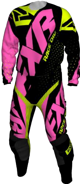
BLACK/ELECTRIC PINK/ HI-VIS JERSEY 193312-1094-I PANT 193323-1094-