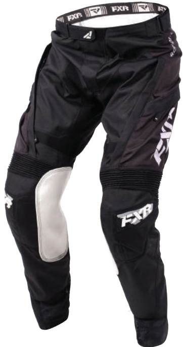
ITB BLACK 183310-1000-