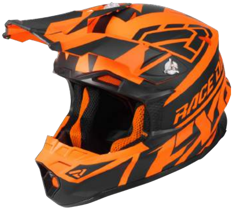
BLACK/FLO ORANGE | 190605-1033- [MATTE FINISH]