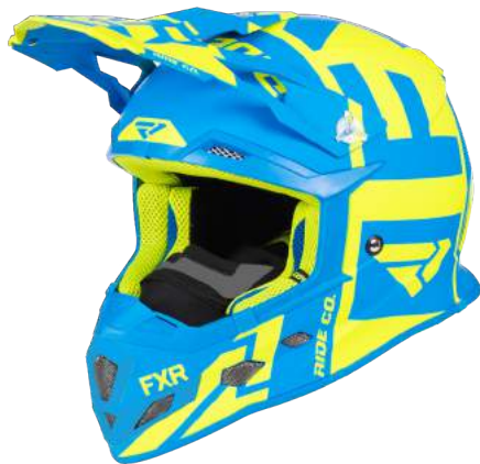
HI-VIS/BLUE | 190606-6540- [MATTE FINISH]