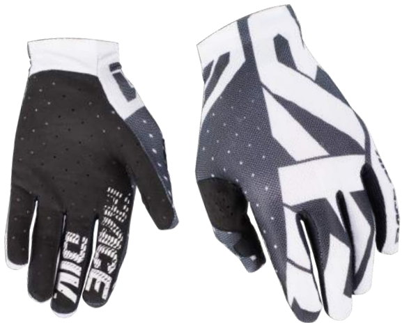
BLACK/WHITE | 193355-1001-