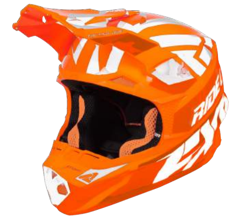
ORANGE/WHITE | 190605-3001- [MATTE FINISH]