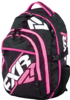
BLACK/FUCHSIA | 15905.901