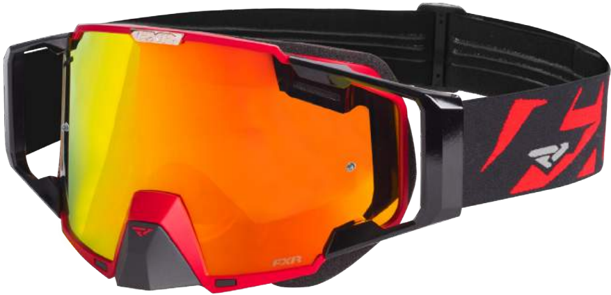
BLACK/RED | 183140-1020- [SMOKE LENS + SOLAR FINISH]