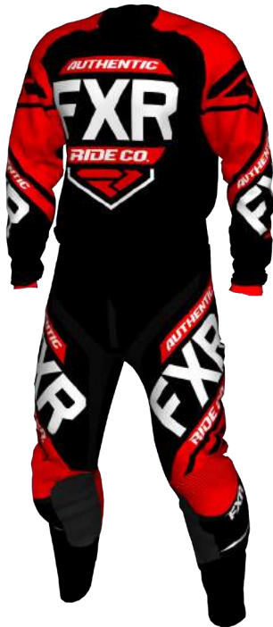
BLACK/RED/WHITE JERSEY 193308-1020- | PANT 193327-1020-

New lightweight polyester birdseye knit fabric Moisture-wicking yarns dry quickly Shaped front collar and tapered cuff New slim fit Drop-tail hem and long length protect midriff exposure Fade-free sublimation prints