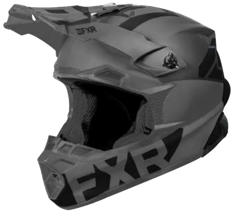
BLACK OPS | 190608-1010- [MATTE FINISH]