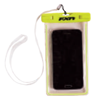
HI-VIS | 15997.700 OS-00