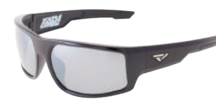
BLACK | 16714.100