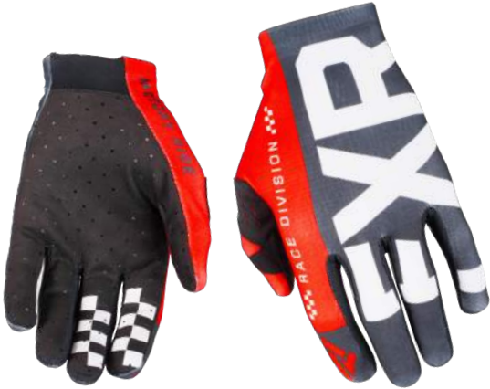
BLACK/RED/WHITE | 193351-1020-