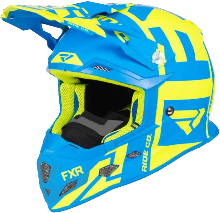
HI-VIS/BLEU | 190631-6540- [MATTE FINISH]