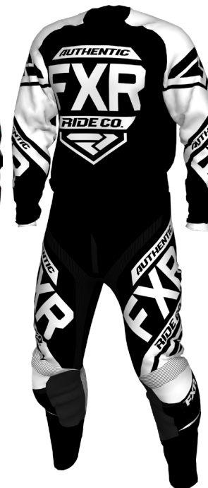
BLACK/WHITE JERSEY 193324-1001- PANT 193322-1001-