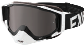
WHITE/BLACK | 183142-0110- [SMOKE LENS + PLATINUM FINISH]