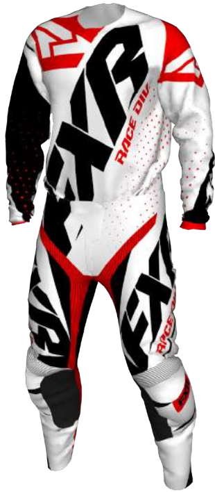
WHITE/BLACK/RED JERSEY 193301-0120- | PANT 193328-0120-