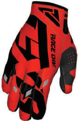
NUKE RED/BLACK | 193354-2310-