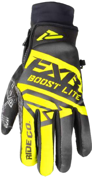
BLACK/HI-VIS | 180809-1065-