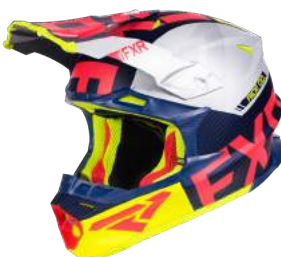
NAVY/RED/HI-VIS/SILVER 190604-4502- [MATTE FINISH]