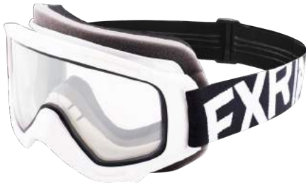
WHITE/BLACK | 183146-0110- [CLEAR LENS]