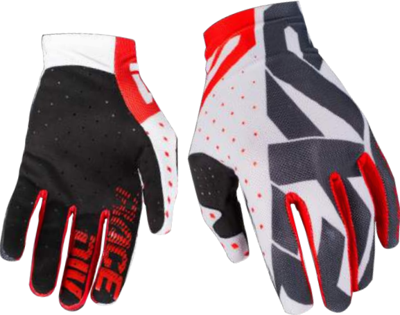
WHITE/BLACK/RED | 193355-0120-