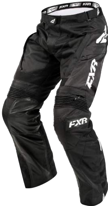
OTB BLACK 183311-1000-