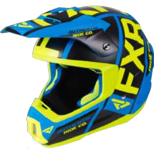
BLUE/HI-VIS/BLACK | 190621-4065- [MATTE FINISH]