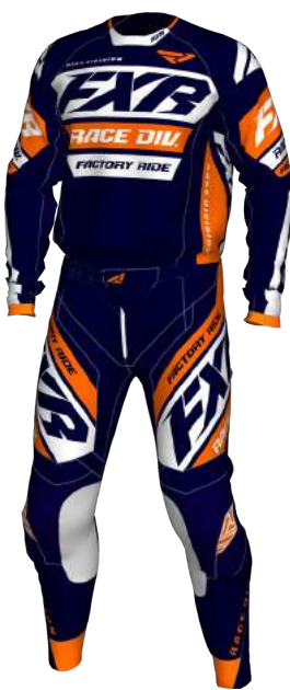
DARK NAVY/WHITE/ORANGE JERSEY 193305-4530- PANT 193340-4530-