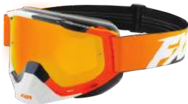
ORG/BLACK/WHITE | 183144-3010- [SMOKE LENS + SOLAR FINISH]

Impact resistant, pre-curved polycarbonate lens Premium anti-scratch, anti-fog, & UV lens coatings Moisture wicking face fabric Triple density, contoured face foam Premium strap with Tripple silicone grips Removable nose piece Soft storage/cleaning pouch included Tear off and Roll-off systems available Extra lens options available