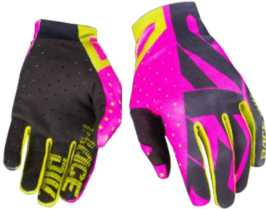
ELECTRIC PINK/BLACK/HI-VIS | 193351-9410-