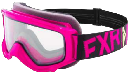
FUCHSIA/BLACK/HI-VIS | 183146-9065- [CLEAR LENS]