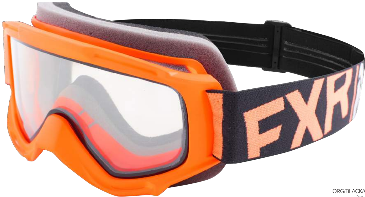
ORG/BLACK/WHITE | 183146-3010- [CLEAR LENS]