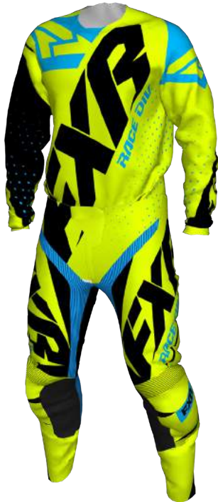
HI-VIS/BLUE/BLACK JERSEY 193312-6540-I PANT 193323-1094-

New lightweight polyester birdseye knit fabric Moisture-wicking yarns dry quickly Shaped front collar and tapered cuff New slim fit Drop-tail hem and long length protect midriff exposure Fade-free sublimation prints