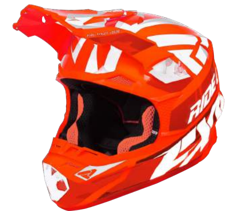
RED/WHITE | 190605-2001- [MATTE FINISH]