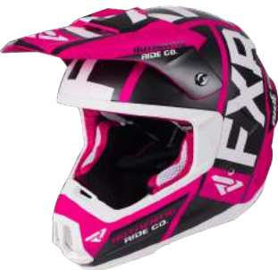
FUCHSIA/BLACK/WHITE | 190621-9010- [MATTE FINISH]