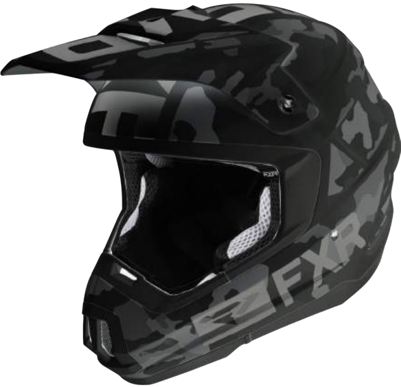
CHAR CAMO/ BLACK | 190619-0610- [MATTE FINISH]