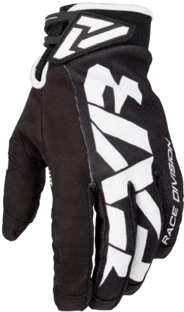
BLACK/WHITE | 173343-1001-