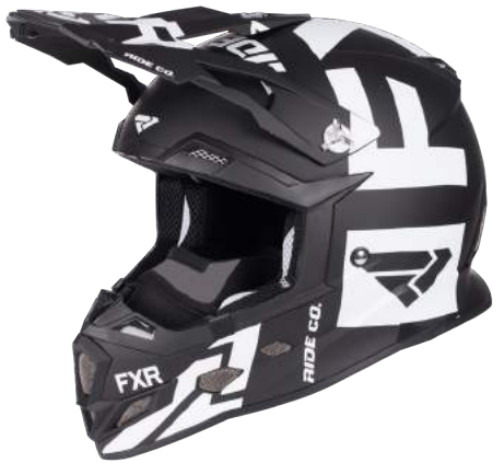
BLACK/WHITE | 190606-1001- [MATTE FINISH]