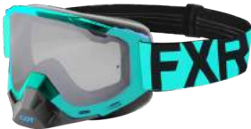
MINT/BLACK | 193147-5210- [CLEAR LENS]