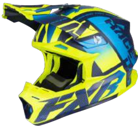
BLUE/HI-VIS/NAVY 190603-4065- [MATTE FINISH]