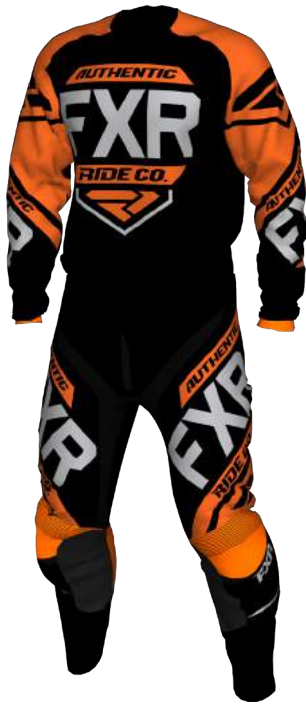
BLACK/ORANGE/LT GREY JERSEY 193308-1030- | PANT 193327-1030-