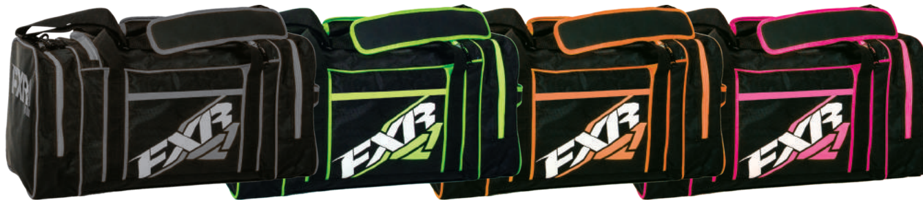
BLACK/CHAR | 15906.201

25" X 12" x 12" | 50L capacity Heavy-duty shell Padded shoulder strap Two-way top zipper and large zippered side pouch Zippered end compartments