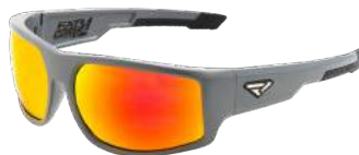
CHARCOAL/ORANGE | 171650-0830-

Polarized impact resistant Polycarbonate lenses with anti-scratch coating Lightweight, poly alloy frame Poly-alloy wrap-around frame for optimized fit engineered Integrated hinges Rubber ear socks for comfort