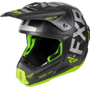
BLACK/LIME/CHAR | 190621-1070- [MATTE FINISH]