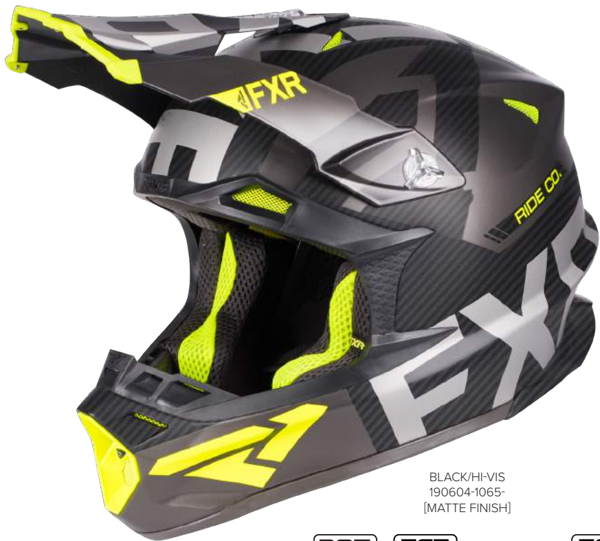
BLACK/HI-VIS 190604-1065- [MATTE FINISH]