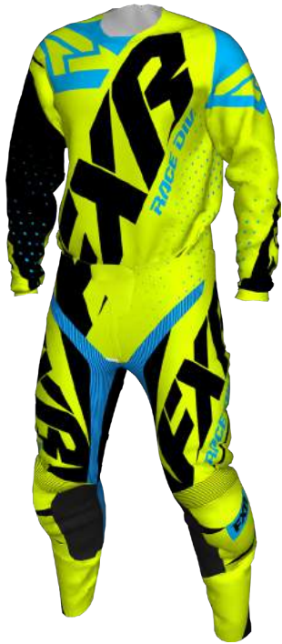
HI-VIS/BLACK/BLUE JERSEY 193301-6540- | PANT 193328-6540-