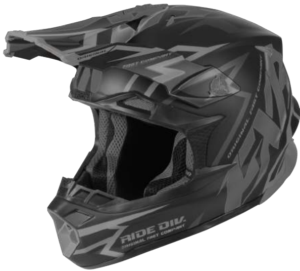
BLACK OPS | 190602-1010- [MATTE FINISH]