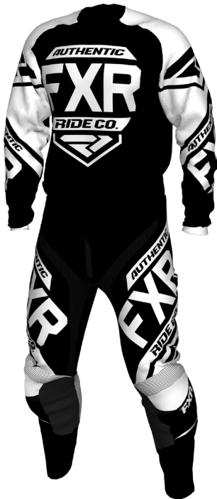
BLACK/WHITE JERSEY 193308-1001- | PANT 193327-1001-