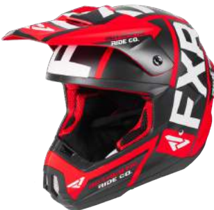
RED/BLACK | 190621-1020- [MATTE FINISH]