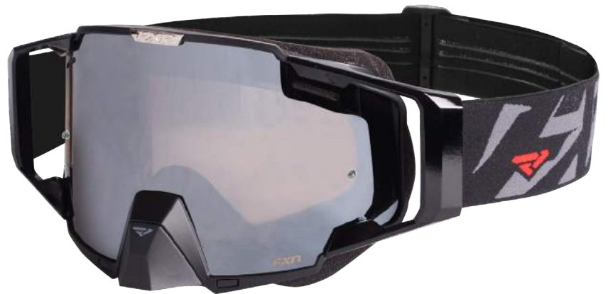
BLACK/CHAR | 183140-1008- [SMOKE LENS + PLATINUM FINISH]