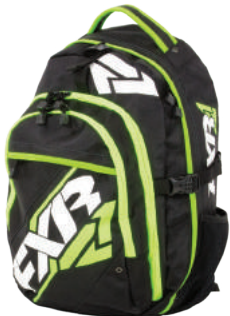
BLACK/LIME | 15905.701