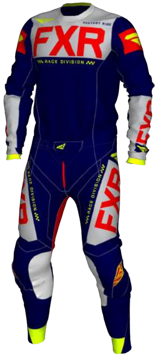
HELIUM LE: NAVY/LT GREY/RED/HI-VIS JERSEY 193309-4520- | PANT 193341-4520-

Lightweight polyester-spandex mesh combined with high performance polyester knit Superior air flow design in the arms and shoulders Moisture-wicking yarns provide quick-dry performance Shaped front collar and tapered cuff Slim fit Drop-tail hem and long length protect midriff exposure