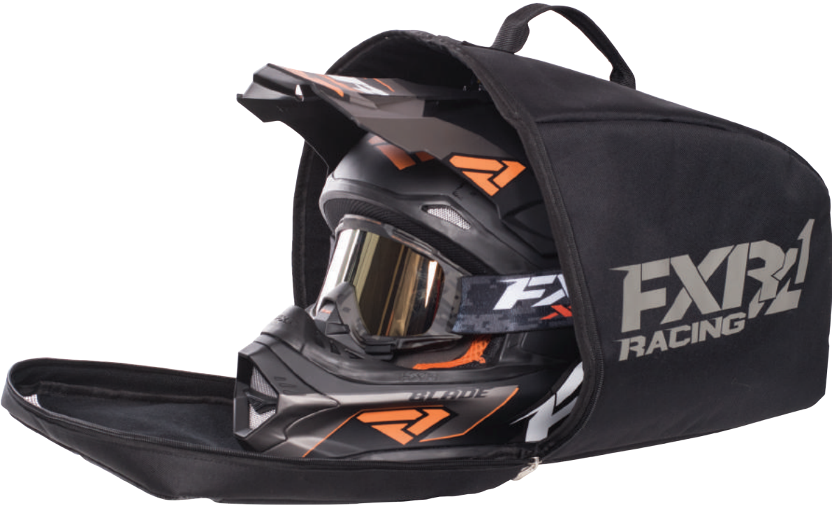
BLACK | 173200-1000-