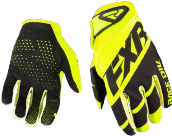
HI-VIS/BLACK | 193352-6510-