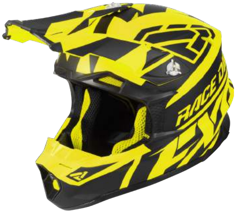
BLACK/HI-VIS | 190605-1065- [MATTE FINISH]