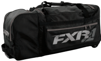
BLACK/CHAR | 193200-1008-