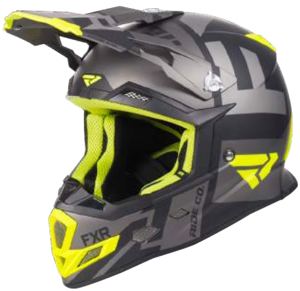
BLACK/HI-VIS/CHAR | 190606- 1065- [MATTE FINISH]