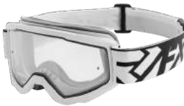
WHITE/BLACK | 183145-0110- [CLEAR LENS]