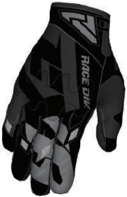
ARMOR MX GLOVE BLACK OPS | 193353-1010-