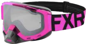
ELECTRIC PINK/BLACK | 193147-9410- [CLEAR LENS]