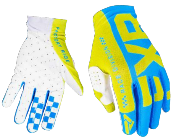
BLUE/HI-VIS | 193355-4065-