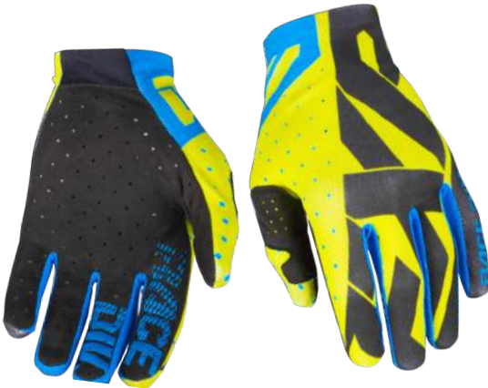
HI-VIS/BLACK/BLUE | 193351-6540-