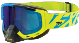
HI-VIS/BLUE | 183144-6540- [SMOKE LENS + COBALT FINISH]