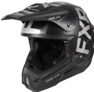
BLACK OPS | 190621-1010- [MATTE FINISH]