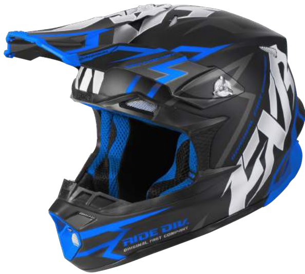
BLACK/BLUE | 190602-1040- [MATTE FINISH]