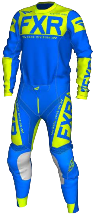
BLUE/HI-VIS JERSEY 193309-4065- | PANT 193341-4065-