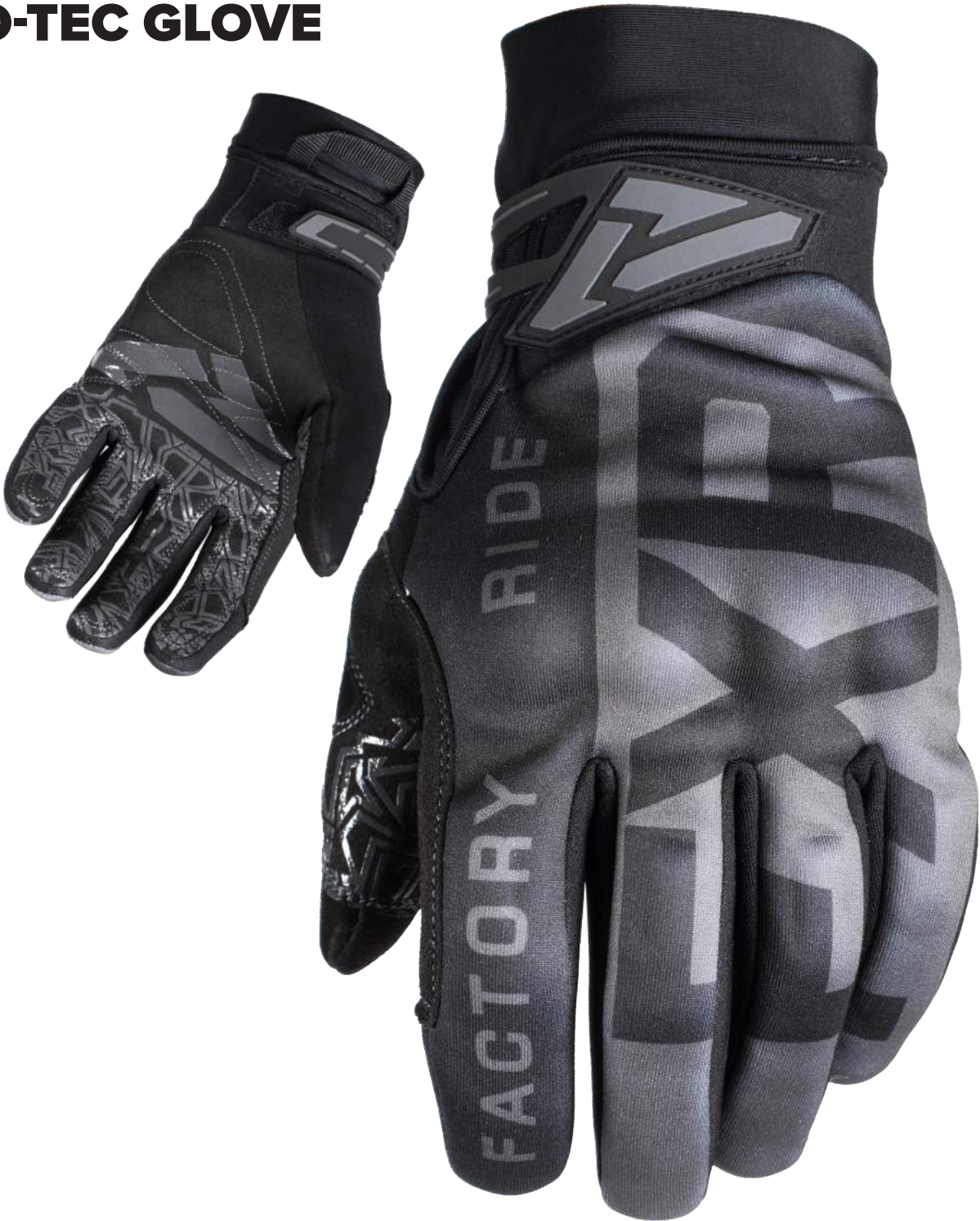
BLACK OPS | 190808-1010-