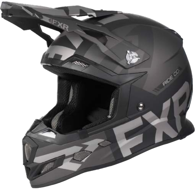
BLACK OPS | 190630-1010- [MATTE FINISH]