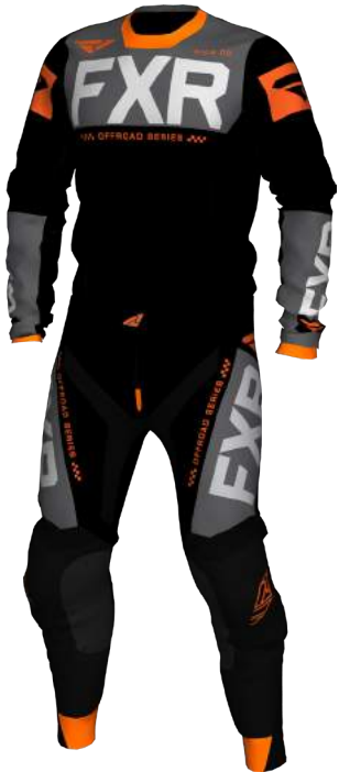
HELIUM OFF-ROAD: BLACK/CHAR/LT GREY/ORANGE JERSEY 193317-1030- | PANT 193338-1030-

Lightweight polyester-spandex mesh combined with high performance polyester knit Superior air flow design through the body Moisture-wicking yarns provide quick-dry performance Shaped front collar and tapered cuff Slim fit Drop-tail hem and long length protect midriff exposure