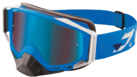
BLUE/WHITE | 193142-4001- [CRIMSON LENS + SAPPHIRE FINISH]