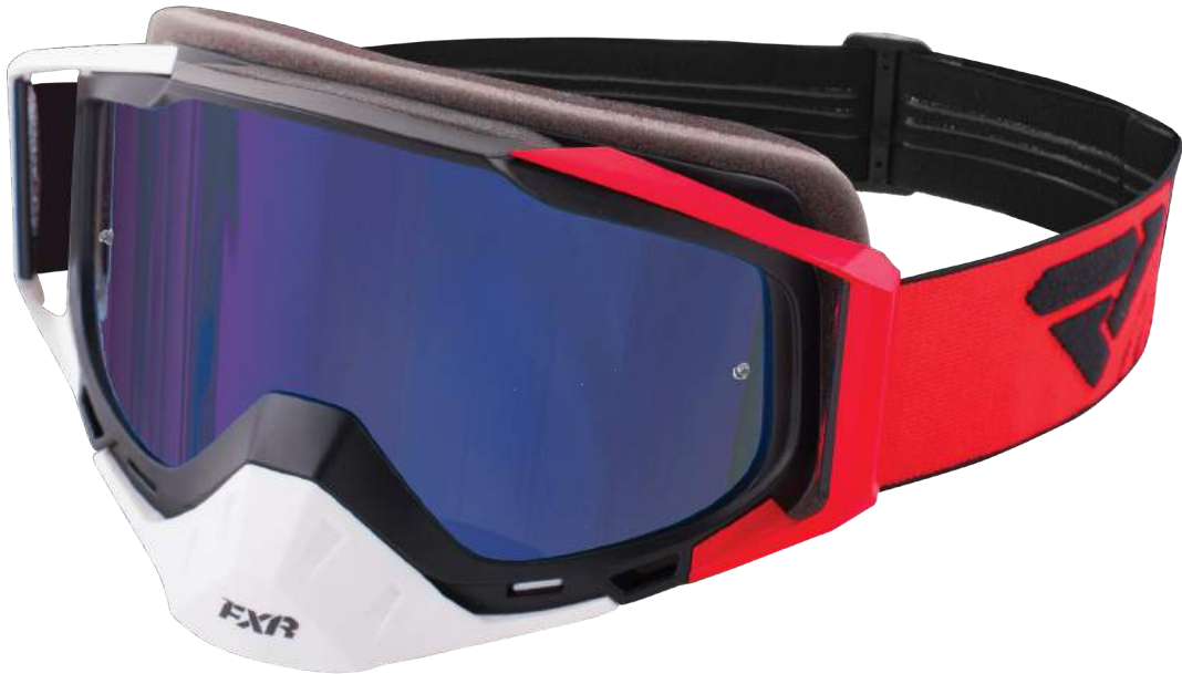
RED/WHITE/BLACK | 183141-2001- [CRIMSON LENS + SAPPHIRE FINISH]