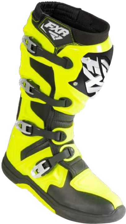
HI-VIS/BLACK | 183330-6510-