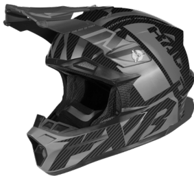
BLACK OPS 190603-1010- [MATTE FINISH]