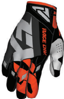
BLACK/ORANGE/GREY/CHAR | 193354-1030-