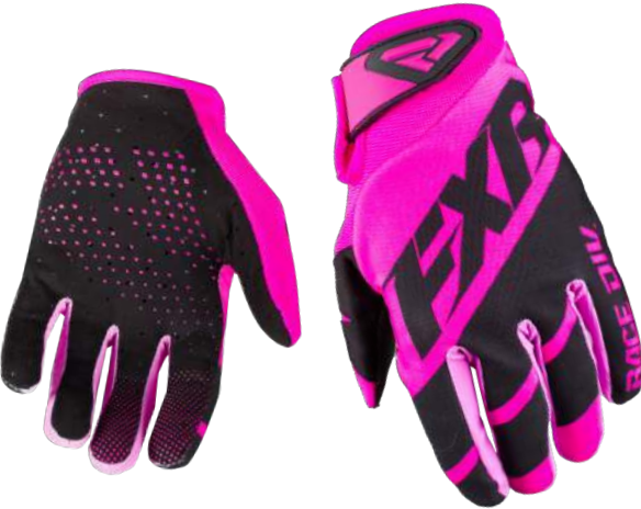
ELECTRIC PINK/BLACK | 193352-9410-