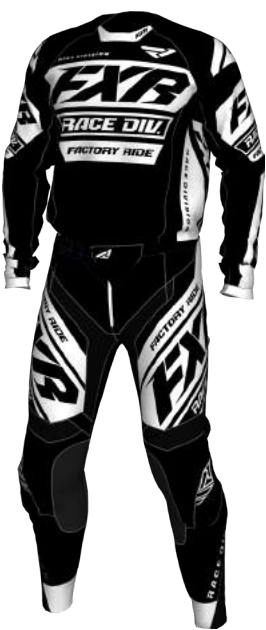
BLACK/WHITE JERSEY 193305-1001- PANT 193340-1001-