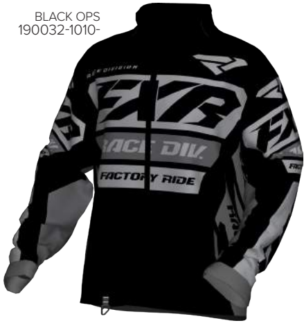
BLACK OPS 190032-1010-