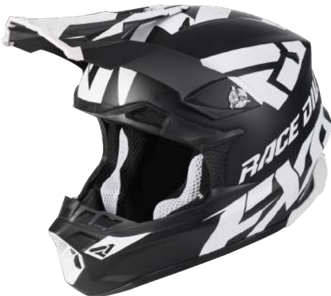
BLACK/WHITE | 190605-1001- [MATTE FINISH]