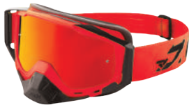
RED/BLACK | 193142-2010- [SMOKE LENS + SOLAR FINISH]