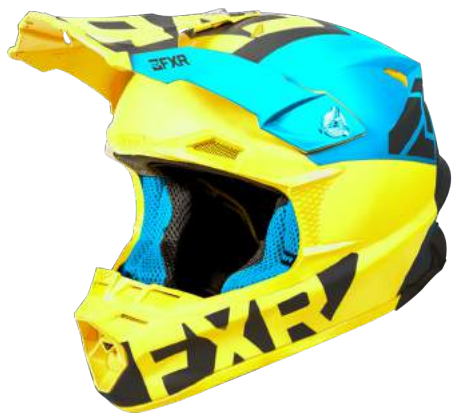
BLUE/HI-VIS/BLACK | 190608-4065- [MATTE FINISH]