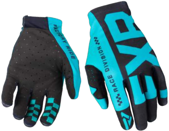
BLACK/MINT | 193351-1052-