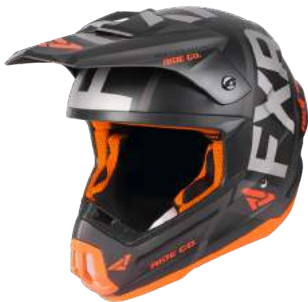
BLACK/FLO ORANGE/CHAR | 190621-1033- [MATTE FINISH]

Quick release, easy adjust buckle Hygienically-treated, removable, washable, moisture-wicking comfort liner