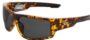
TORTOISE/BLACK | 171650-1610-