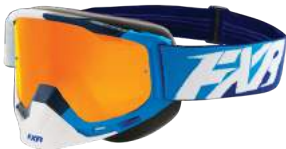
BLUE/WHITE/NAVY | 183144-4001- [SMOKE LENS + SOLAR FINISH]