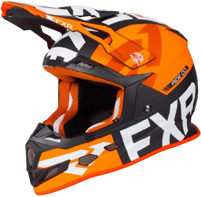
BLACK/ORANGE | 190630-1030- [MATTE FINISH]