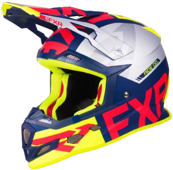
NAVY/RED/Hi-VIS/SILVER | 190607-4520- [MATTE FINISH]