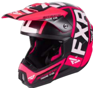
CORAL/BLACK | 190621-9310- [MATTE FINISH]