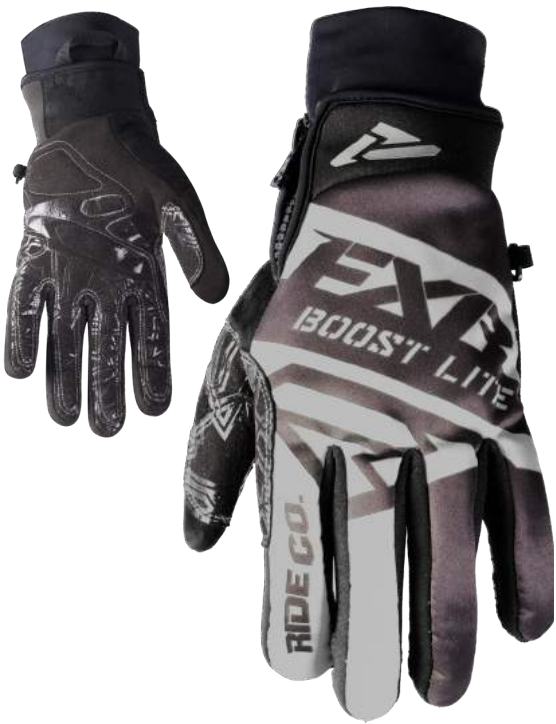
BLACK | 180809-1000-