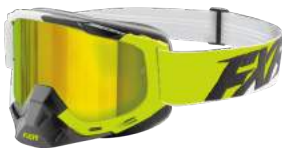
LIME/WHITE/BLACK | 183144-7001- [SMOKE LENS + VENOM FINISH]