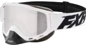
WHITE/BLACK | 183144-0110- [SMOKE LENS + PLATINUM FINISH]