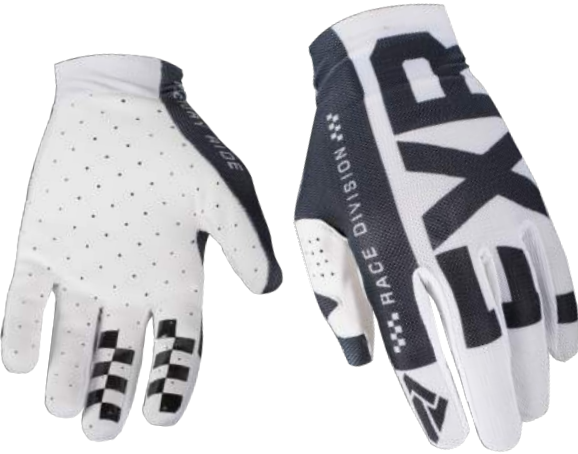
WHITE/BLACK | 193355-0110-