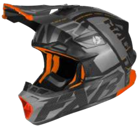
CHAR/GREY/FLO ORANGE 190603-0805- [MATTE FINISH]