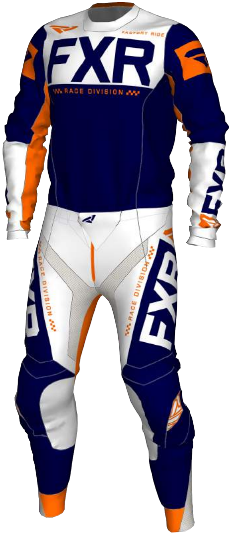
NAVY/WHITE/ORANGE JERSEY 193310-4530- | PANT 193342-4530-

New lightweight mesh fabric for maximum breathability Moisture-wicking yarns provide quick-dry performance Shaped front collar and tapered cuff Slim fit Drop-tail hem and long length protect midriff exposure