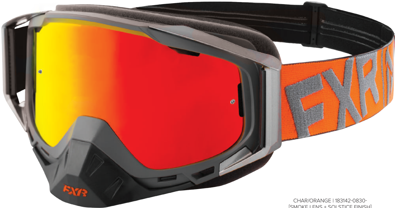
CHAR/ORANGE | 183142-0830- [SMOKE LENS + SOLSTICE FINISH]