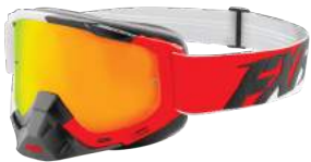
RED/WHITE/BLACK | 183144-2001- [SMOKE LENS + SOLAR FINISH]