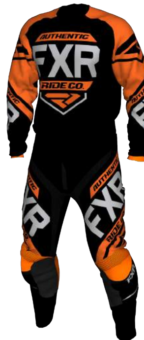
BLACK/ORANGE/LT GREY JERSEY 193324-1030- PANT 193322-1030-