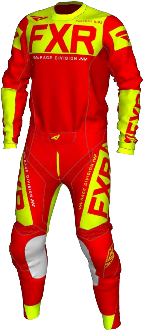
RED/HI-VIS JERSEY 193310-2065- | PANT 193342-2065-

Completely new chassis design for improved fit and comfort New durable lightweight mesh fabric for maximum breathability New knee design provides a slim fit Lightweight breathable mesh inserts for added ventilation, and flexibility Leather panel at inner knee for heat and abrasion protection Triple topstitching in critical areas for extra strength and durability Tested and proven hook and loop adjustable waist system design Silicone printed inner elastic waist for extra grip and security Inner removable hip padding for extra protection TPR Logo Fade-free sublimation prints