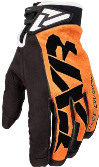
ORANGE/BLACK | 173343-3010-