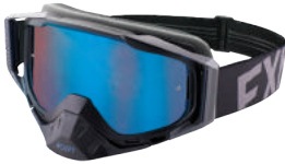
BLACK OPS | 183142-1010- [CRIMSON LENS + SAPPHIRE FINISH]