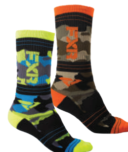
MULTI COLOUR CAMO 171640-6506-