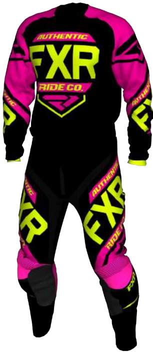
BLACK/FUCHSIA/HI-VIS JERSEY 193308-1090- | PANT 193327-1090-