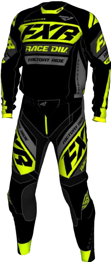
BLACK/CHAR/HI-VIS/GREY JERSEY 193305-1065- PANT 193340-1065-