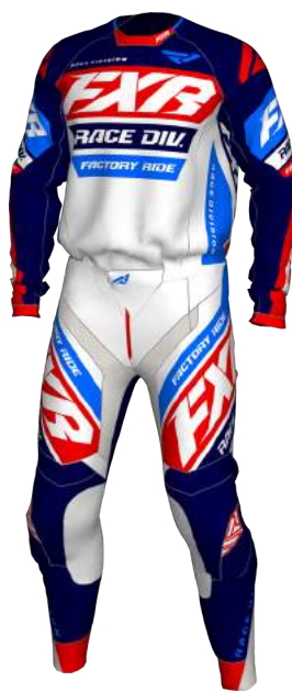
WHITE/NAVY/RED/BLUE JERSEY 193305-4520- PANT 193340-4520-

Lightweight polyester-spandex mesh for superior air flow and rider comfort Shaped front collar and tapered cuff Slim fit Drop-tail hem and long length protect midriff exposure Fade-free sublimation prints