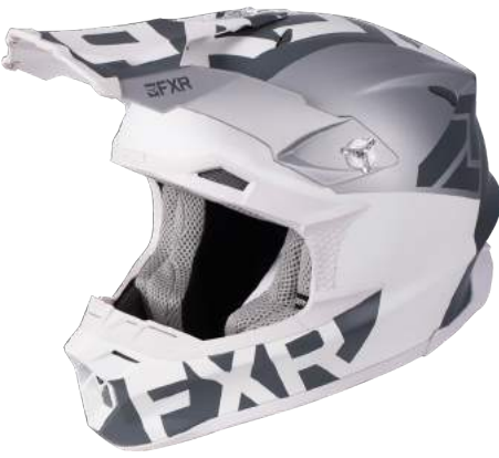
WHITE/GREY | 190608-0105- [MATTE FINISH]