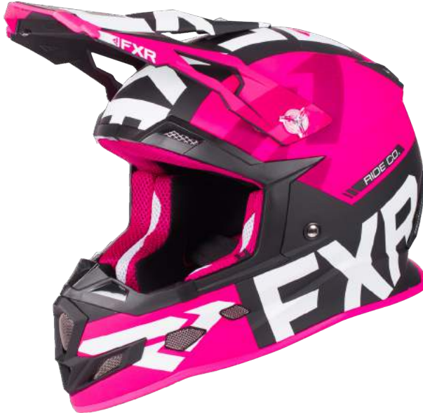
BLACK/FUCHSIA | 190607- 1090- [MATTE FINISH]