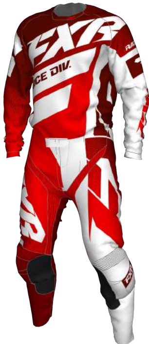
MAROON/RED FADE/WHITE JERSEY 193303-2501- | PANT 193326-2501-

New lightweight polyester birdseye knit fabric Moisture-wicking yarns dry quickly Shaped front collar and tapered cuff New slim fit Drop-tail hem and long length protect midriff exposure Fade-free sublimation prints