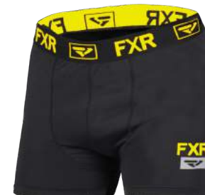
GREY HEATHER/HI-VIS 191342-0765-