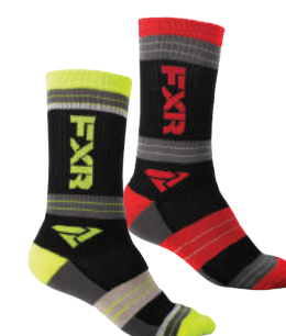
MULTI COLOUR 171640-3065-