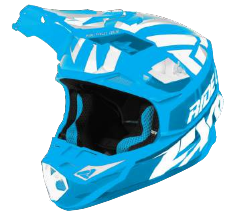
BLUE/WHITE | 190605-4001- [MATTE FINISH]

DOT ECE FROM 1300G ECE FROM 1250G (EUROPE ONLY)