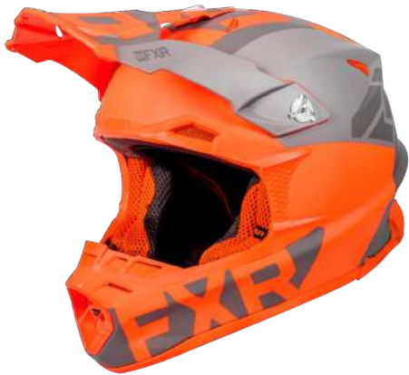
FLO ORANGE/GREY/CHAR | 190608-3305- [MATTE FINISH]