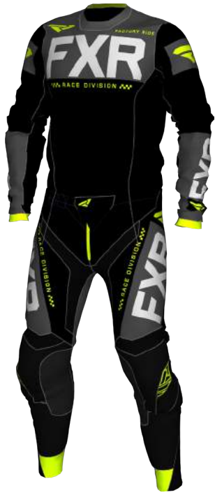
BLACK/CHAR/GREY/HI-VIS JERSEY 193309-1065- | PANT 193341-1065-