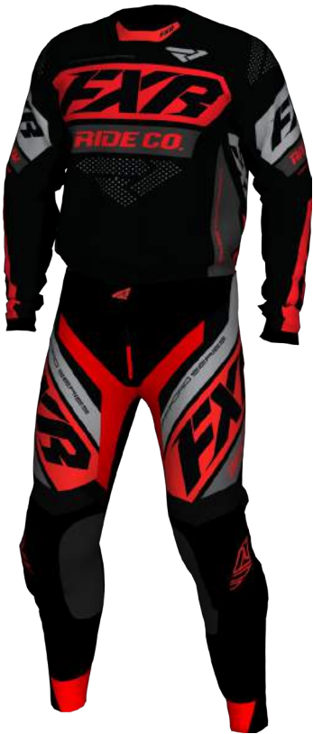
REVO OFF-ROAD: BLACK/NUKE RED/CHAR JERSEY 193320-1023- | PANT 193337-1023-

Lightweight polyester-spandex mesh combined with high performance polyester knit Moisture-wicking yarns provide quick-dry performance Shaped front collar and tapered cuff Slim fit Drop-tail hem and long length protect midriff exposure Fade-free sublimation prints