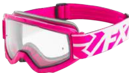
FUCHSIA | 183145-9000- [CLEAR LENS]