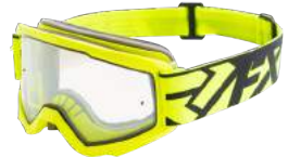
HI-VIS/BLACK | 183145-6510- [CLEAR LENS]

Impact resistant, pre-curved polycarbonate lens Premium anti-scratch, anti-fog, & UV lens coatings Moisture wicking face fabric Triple density, contoured face foam Premium strap with Tripple silicone grips Removable nose piece Soft storage/cleaning pouch included Tear off and Roll-off systems available Extra lens options available