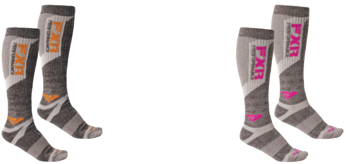
GREY/ORANGE | 15836.203 GREY/FUCHSIA | 15836.209