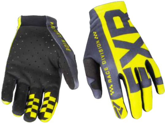
HI-VIS/BLACK | 193351-6510-