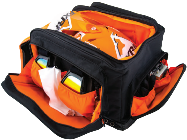
BLACK | 173200-1000-