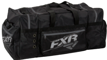
BLACK/CHAR | 15907.201