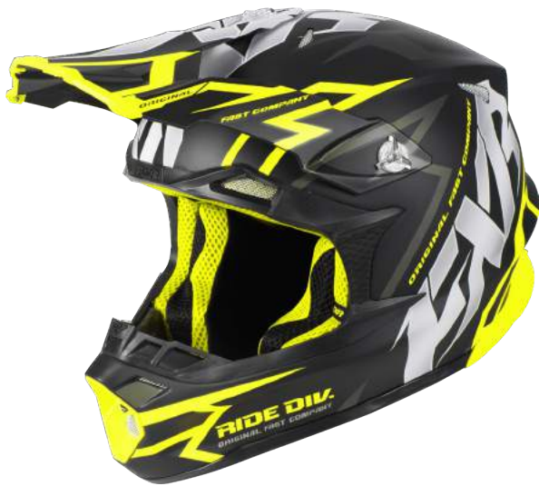
BLACK/HI-VIS | 190602-1065- [MATTE FINISH]