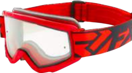
RED/BLACK | 183145-2010- [CLEAR LENS]