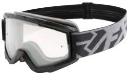
BLACK OPS | 183145-1010- [CLEAR LENS]