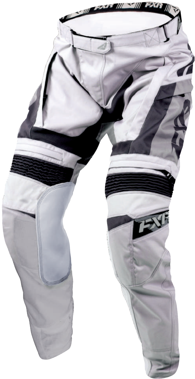
ITB GREY 183310-0500-