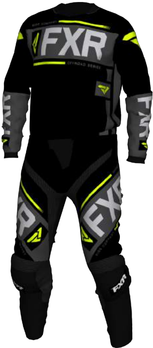
CLUTCH OFF-ROAD: BLACK/CHAR/HI-VIS/LT GREY JERSEY 193318-1065- | PANT 193336-1065-

Completely new chassis design for improved fit and comfort Durable 4-way stretch fabric provides class leading fit and mobility New knee design provides a slim fit Leather panel at inner knee for heat and abrasion protection Soft stretchable mesh knit at back leg areas for added flexibility, ventilation and comfort Triple topstitching in critical areas for extra strength and durability Tested and proven hook and loop adjustable waist system design Silicone printed inner elastic waist for extra grip and security Inner removable hip padding for extra protection TPR logo Fade-free sublimation prints