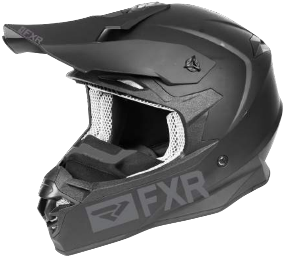
BLACK OPS | 190620-1010- [MATTE FINISH]