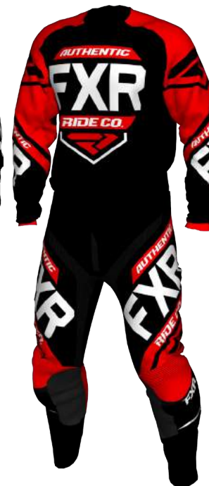
BLACK/RED/WHITE JERSEY 193324-1020- PANT 193322-1020-