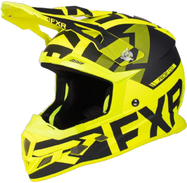
BLACK/Hi-VIS | 190607-1065- [MATTE FINISH]