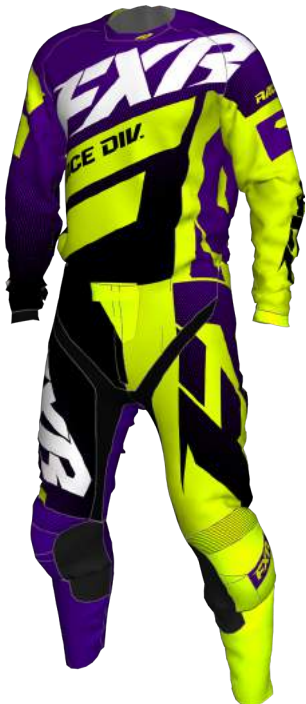
PURPLE/BLACK FADE/HI-VIS JERSEY 193303-8065- | PANT 193326-8065-