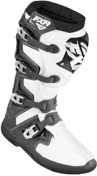
BLACK/WHITE | 183330-1001-