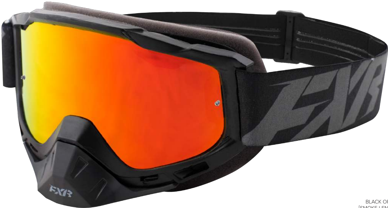
BLACK OPS | 183144-1010- [SMOKE LENS + SOLAR FINISH]