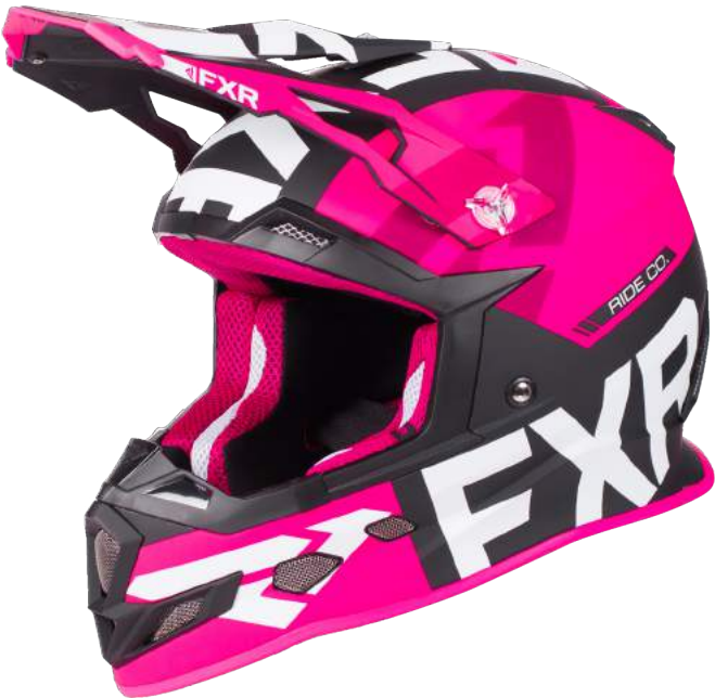
BLACK/FUCHSIA | 190630-1090- [MATTE FINISH]