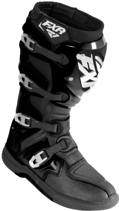
BLACK | 183330-1000-

ENGINEERED TO EXCEED THE PERFORMANCE DEMANDS AND DURABILITY STANDARDS OF ANY BOOT IN ITS CLASS