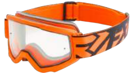
ORANGE/BLACK | 183145-3010- [CLEAR LENS]