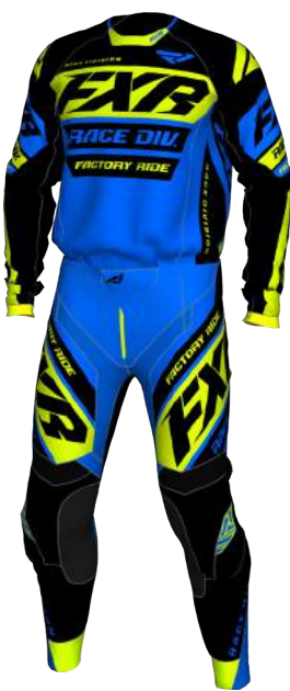
BLUE/BLACK/HI-VIS JERSEY 193305-4065- PANT 193340-4065-