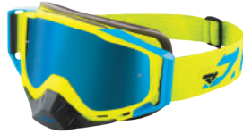
HI-VIS/BLUE | 183142-6540- [SMOKE LENS + COBALT FINISH]

Outrigger frame for perfect fit & tension Impact resistant, pre-curved polycarbonate lens Premium anti-scratch, anti-fog, & UV lens coatings Moisture wicking face fabric Triple density, contoured face foam Premium strap with Tripple silicone grips Removable nose piece Soft storage/cleaning pouch included Tear off and Roll-off systems available Extra lens options available