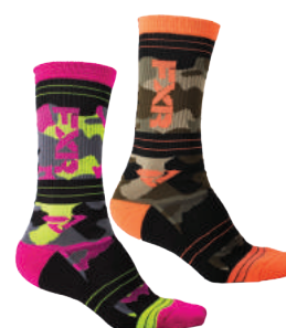
MULTI COLOUR CAMO 171641-9006-