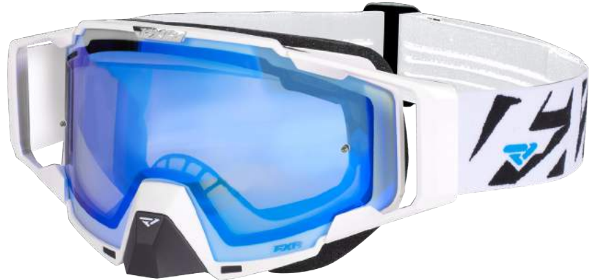
WHITE/BLACK | 183140-0110- [CRIMSON LENS + SAPPHIRE FINISH]