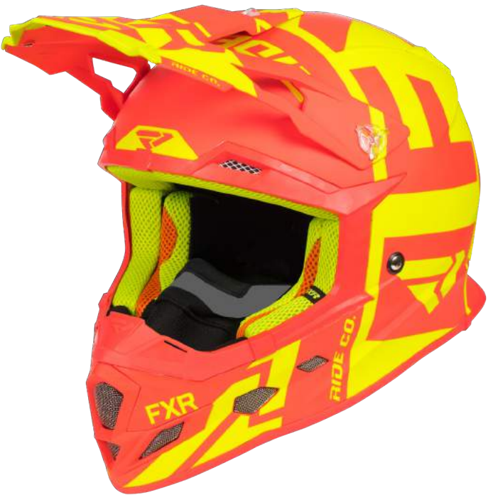
HI-VIS/NUKE RED | 190631-6523- [MATTE FINISH]