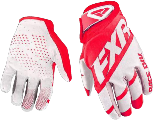
RED/WHITE | 193352-2001-