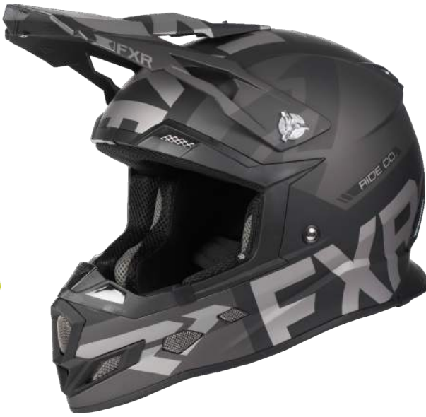
BLACK OPS | 190607-1010- [MATTE FINISH]