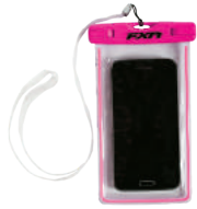
FUCHSIA | 15997.900 OS-00