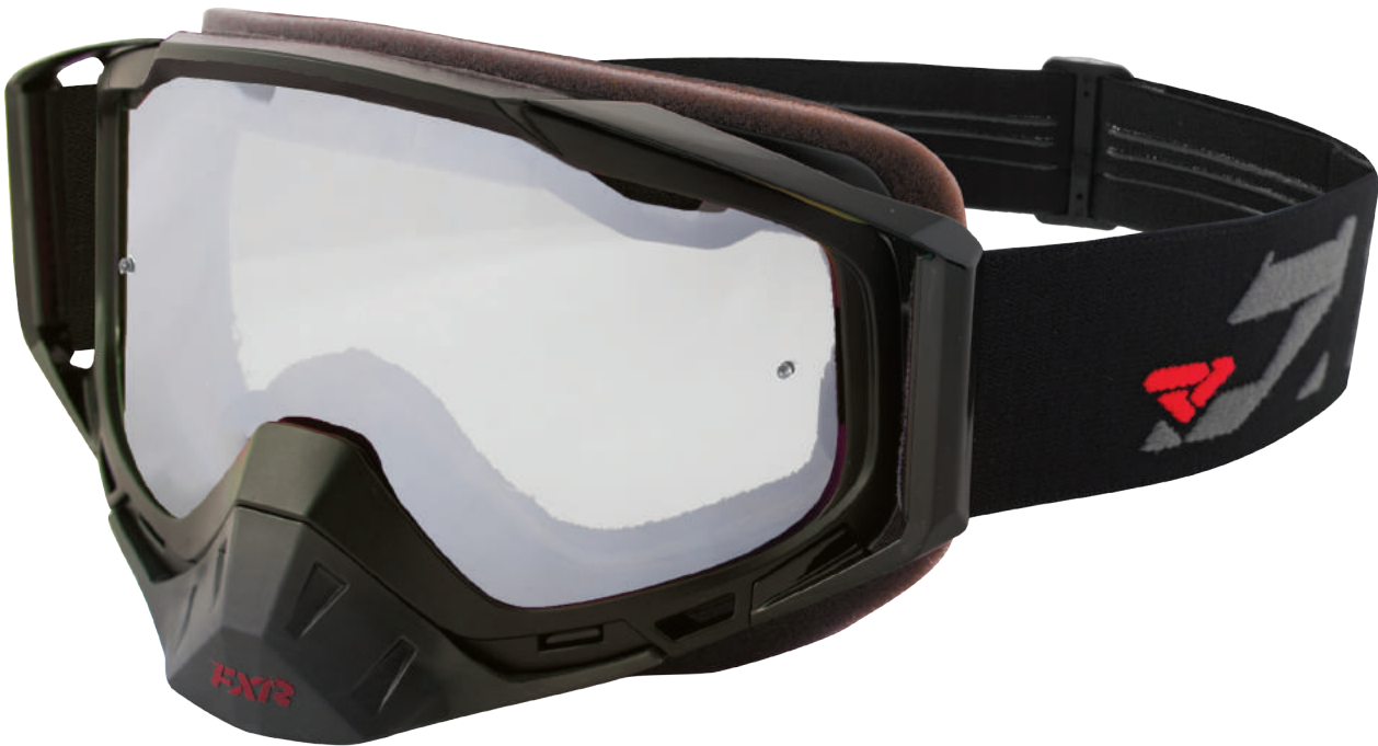
BLACK/CHAR | 183143-1008- [CLEAR LENS]