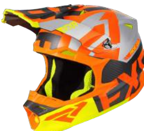
BLACK/ORANGE/HI-VIS/SILVER 190604-1030- [MATTE FINISH]