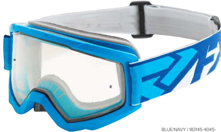
BLUE/NAVY | 183145-4045- [CLEAR LENS]