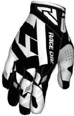
BLACK/WHITE | 193354-1001-