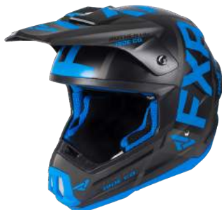
BLACK/BLUE/CHAR | 190621-1040- [MATTE FINISH]