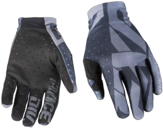
BLACK OPS | 193351-1010-