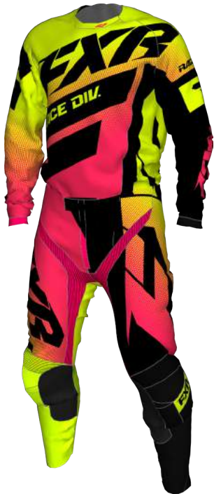
HI-VIS/CORAL FADE/BLACK JERSEY 193303-6593- | PANT 193326-6593-