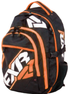
BLACK/ORANGE | 15905.301