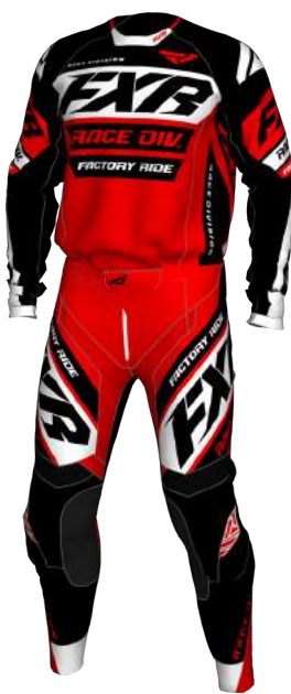
RED/BLACK/WHITE JERSEY 193305-2010- PANT 193340-2010-