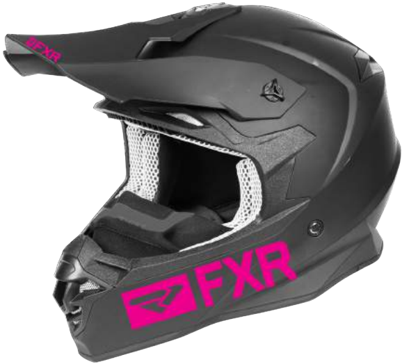
BLACK/ELECTRIC PINK | 190620-1094- [MATTE FINISH]