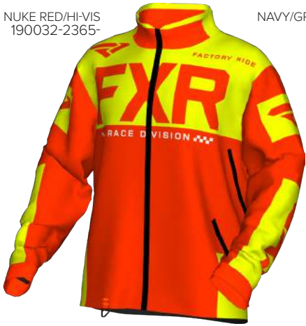
NUKE RED/HI-VIS 190032-2365-