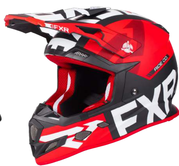
BLACK/RED | 190607-1020- [MATTE FINISH]