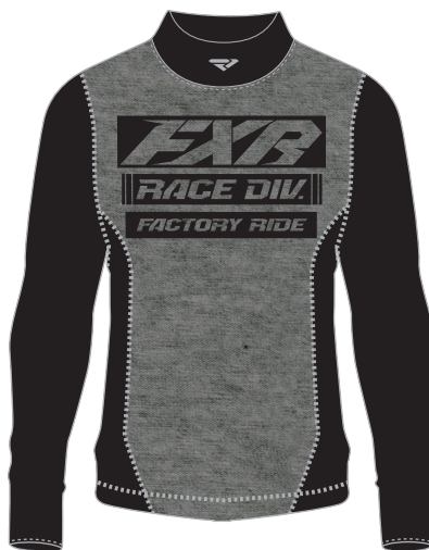
BLACK OPS 191328-1010-