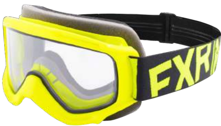
HI-VIS/BLACK | 183146-6510- [CLEAR LENS]