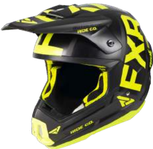
BLACK/HI-VIS/CHAR | 190621-1065- [MATTE FINISH]