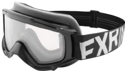
BLACK OPS | 183146-1010- [CLEAR LENS]

Impact resistant, pre-curved polycarbonate lens Anti-scratch, anti-fog, & UV lens coatings Triple density, moisture wicking, contoured face foam & fabric Adjustable strap with silicone grip Tear off system available