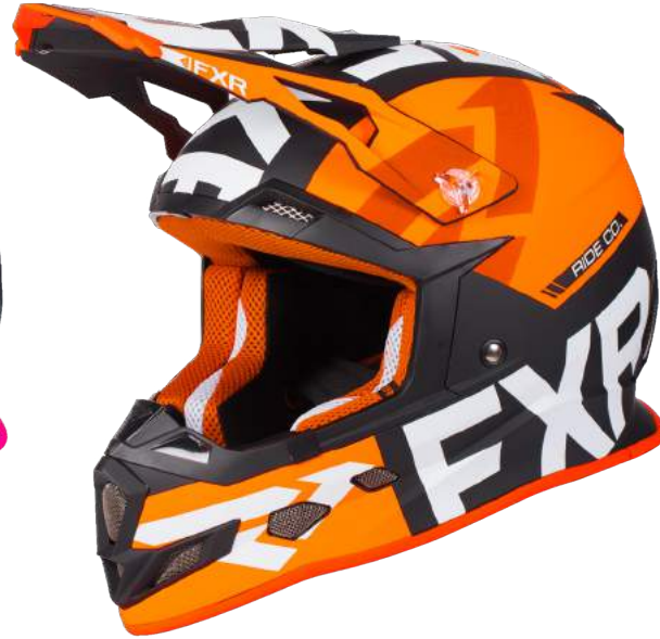
BLACK/ORANGE | 190607-1030- [MATTE FINISH]

2019 MX MX GEAR HELMETS BOOTS GOGGLES GLOVES LAYERWEAR & ACCESSORIES