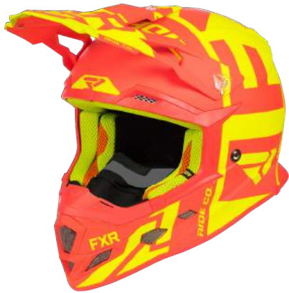
HI-VIS/NUKE RED | 190606-6523- [MATTE FINISH]