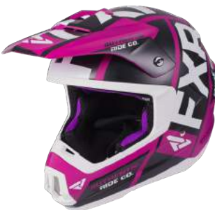
WINEBERRY/BLACK/WHITE | 190621-8510- [MATTE FINISH]