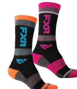
MULTI COLOUR 171641-9055-