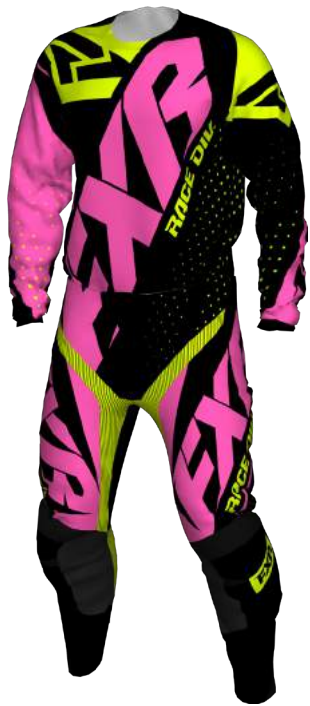
BLACK/ELECTRIC PINK/HI-VIS JERSEY 193301-1094- | PANT 193328-1094-