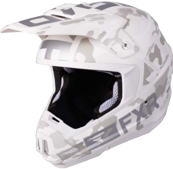
WHITE CAMO/WHITE | 190619-0201- [MATTE FINISH]

2019 MX MX GEAR HELMETS BOOTS GOGGLES GLOVES LAYERWEAR & ACCESSORIES