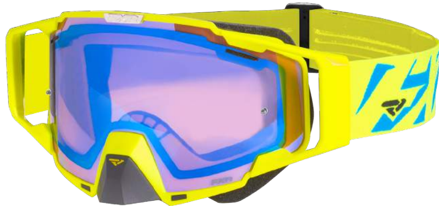
HI-VIS/BLE 183140-6540- [CRIMSON LENS + SAPPHIRE FINISH]