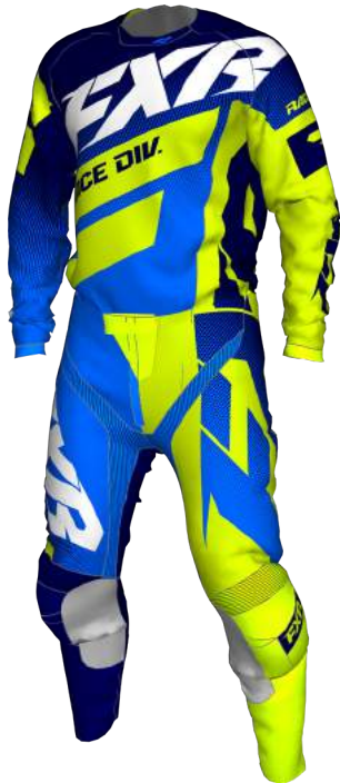
NAVY/BLUE FADE/HI-VIS JERSEY 193303-4565- | PANT 193326-4565-