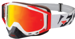
WHITE/RED/BLACK | 183142-0120- [SMOKE LENS + SOLAR FINISH]