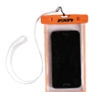
ORANGE | 15997.300 OS-00