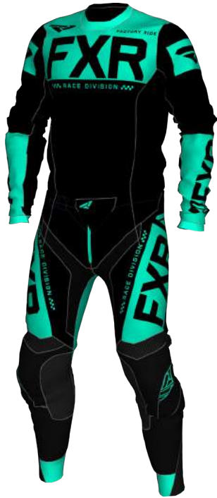
BLACK/MINT JERSEY 193309-1052- | PANT 193341-1052-